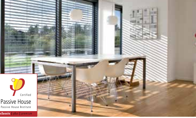
Single family home in Denmark | olav langenkamp, architekt eth-maa | Photo © langenkamp.dk

Step-by-step to EnerPhit – the Passive House Standard for retrofits.