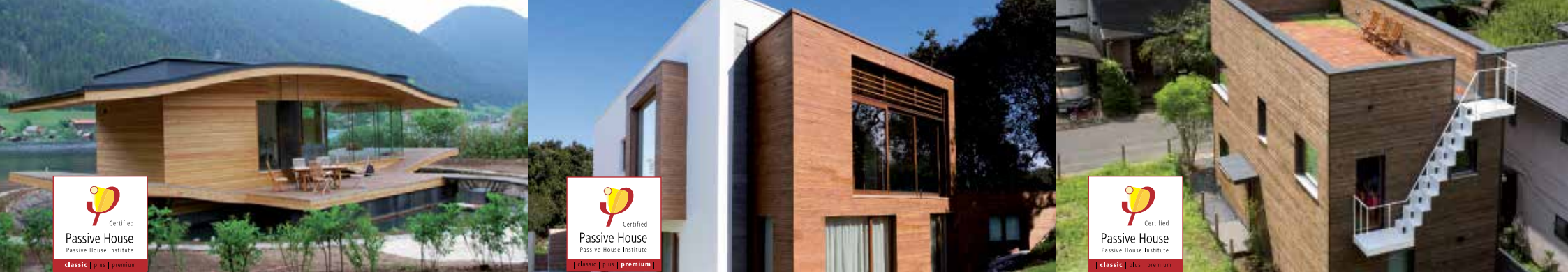
Single family home in Italy | Michael Tribus Architecture