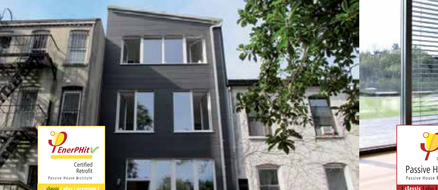
EnerPHit retrofit in New York | Fete Nature Architecture | Photo © Hai Zhang