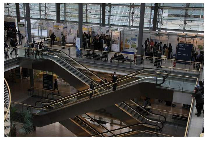
The exhibition area was a popular meeting point for exchange between professional conference visitors and manufacturers of Passive House components.

Since 1997, the International Passive House Conference has been held annually by the Passive House Institute in different locations. The City of Leipzig, the Saxony Chamber of Architects and the University of Innsbruck were co-organisers of the 2015 Conference. In 2016 several Passive House anniversaries will be celebrated, with Darmstadt (Germany) hosting next year's conference. This is the city where the world's first Passive House was built exactly 25 years ago in the city district of Kranichstein, and where the Passive House