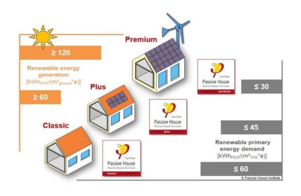
The main specific values of the new Passive House classes which also take into account the generation of energy. Illustration: Passive House Institute

The heating demand of a Passive House may not exceed 15 kWh/(m<sup>2</sup>a). This will continue to apply, but with the introduction of the new categories, the overall demand for renewable primary energy (PER / Primary Energy Renewable) will be used instead of the primary energy demand, which was previously used. In the case of the Passive House Classic category, this value will be 60 kWh/(m<sup>2</sup>a) at the most. A building built to Passive House Plus is more efficient as it may not consume more than 45 kWh/(m<sup>2</sup>a) of renewable primary energy. It must also generate at least 60 kWh/(m<sup>2</sup>a) of energy in relation to the area covered by the building. In the case of Passive House Premium, the energy demand is limited to just 30 kWh/(m<sup>2</sup>a), with at least 120 kWh/(m<sup>2</sup>a) of energy being generated.