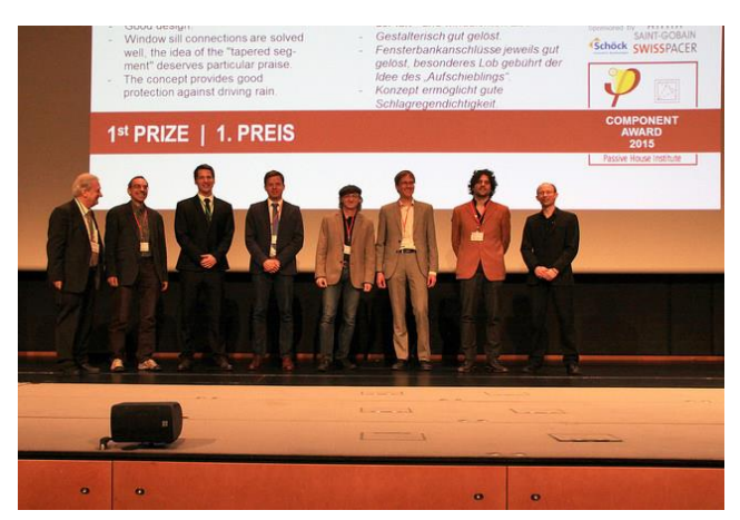
Presentation of the Component Award at the International Passive House Conference.

by-step manner. Ideal windows had to deliver excellent results during the transitional period as well as after the completion of all refurbishment measures. The cost effectiveness of the windows was assessed first and foremost, with a comparison of purchase costs with potential savings. However, the jury also considered practicability, innovation and aesthetics, with a 20 percent weighting for each of these aspects.