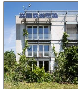
The world's first Passive House building in Darmstadt.